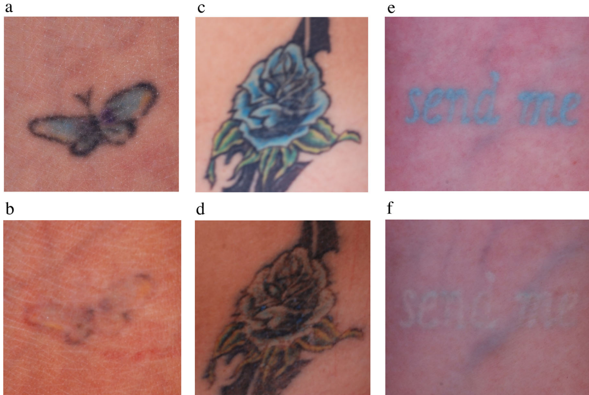
Fig. 1. Cross-polarized, digital images taken before (a,c,e) laser treatment and after (b,d,f) the 4th treatment. Purple, blue, and green pigment cleared almost completely, while some residual yellow and black ink are clearly visible. Cross-polarized photography enhances visibility of tattoos over conventional lighting or non-polarized flash photography.

compared to the 755nm alexandrite and 532nm KTP lasers. Because the 1,064 nm Nd:YAG wavelength is the longest available, it is also the least likely wavelength to target epidermal melanin pigment causing hypopigmentation, an unwanted side effect when treating tattoos. Black ink also tends to require more treatments compared